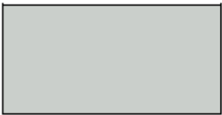
ICE (BS 18 B 19)