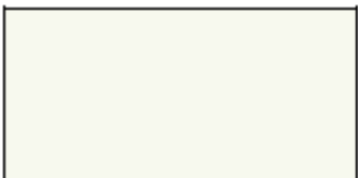
WHITE (RAL 9010)