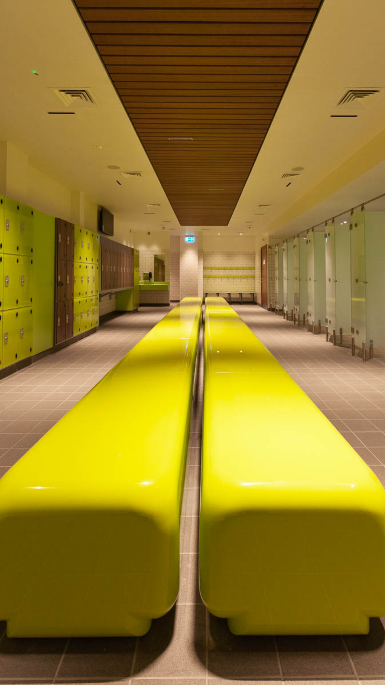
Helmsman - The Complete Package