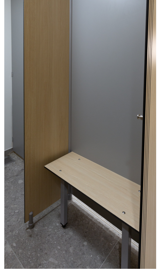
1 Northern Way Bury St Edmunds Suffolk IP32 6NH

(+44) 01284 727626 | sales@helmsman.co.uk | www.helmsman.co.uk