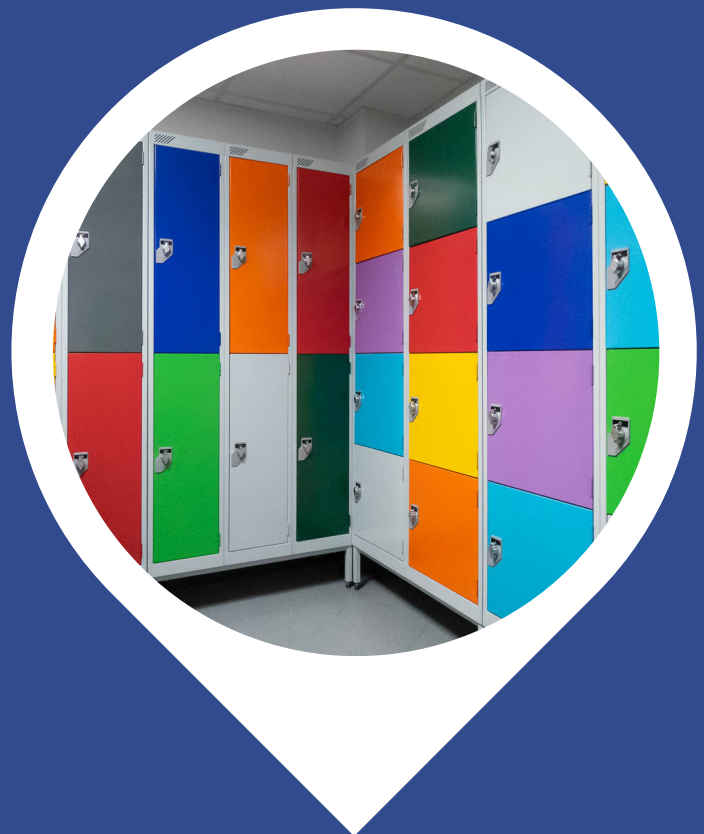
Essential metal lockers with Cam locks