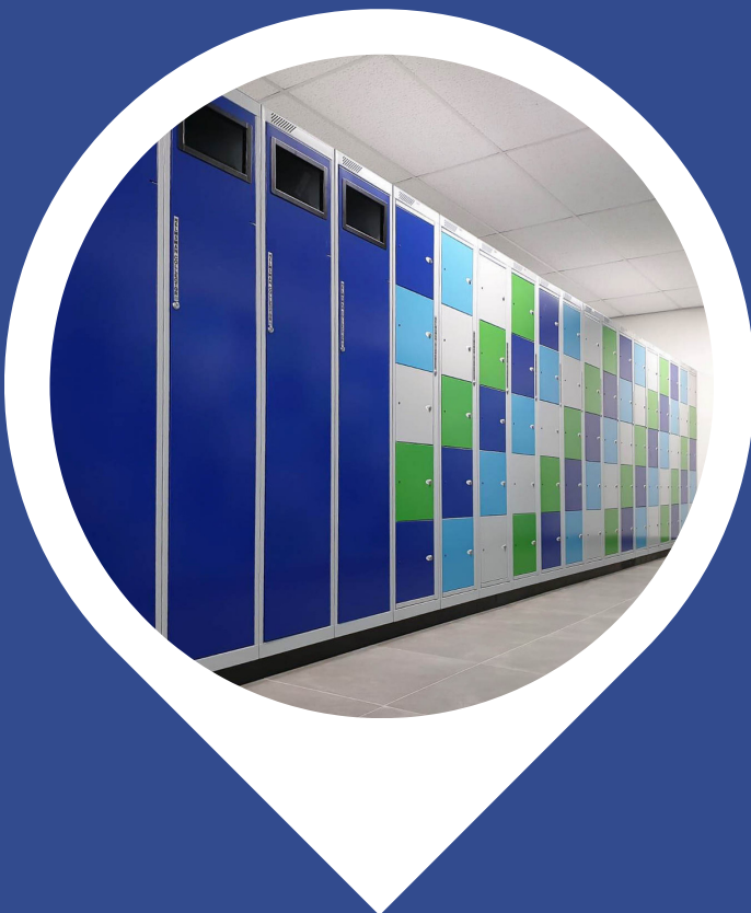
Garment dispensers and collectors with Cam locks

Colour options for the metal door are our standard range. We can match any RAL colour subject to an additional charge. Metal RAL colour samples are available on request.