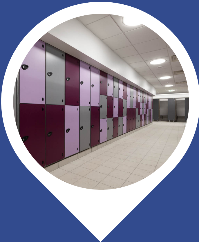
Leisure Lockers with Coin return locks

Colour options for the laminate door are our standard range.