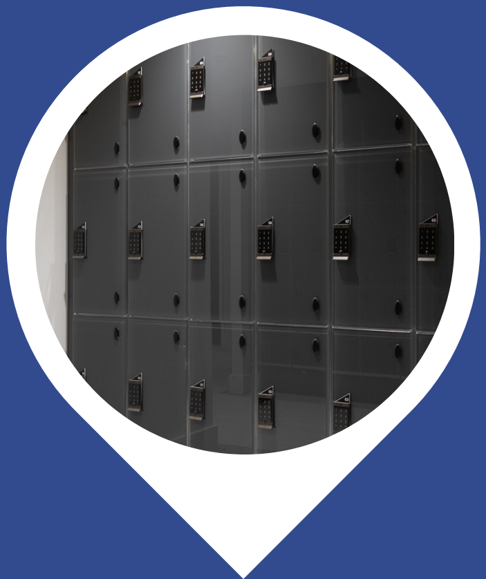
Ojmar OCS combination lock