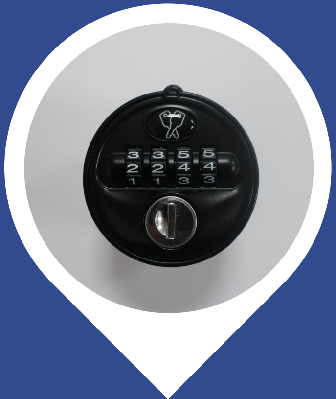
L&F 2800 4 Digit Combination Lock

*Other locks available, please consult Helmsman service department.