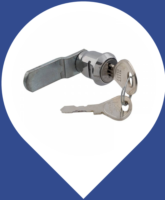
Standard Cam Lock