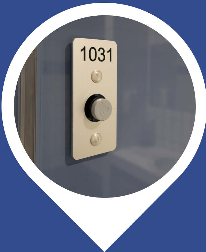
Glass lockers with Ojmar OTS basic locks

Ordering glass may take longer than other materials. Colour options for the glass door are our standard range. To match other colours please consult Helmsman service department.