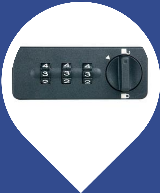
Sudhaus 3 Digit Combination Lock