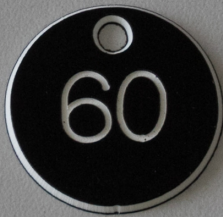
Numbered key fob