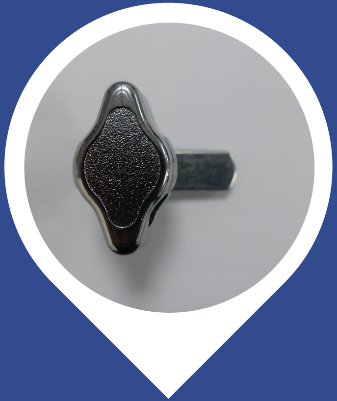
Standard Hasp Lock