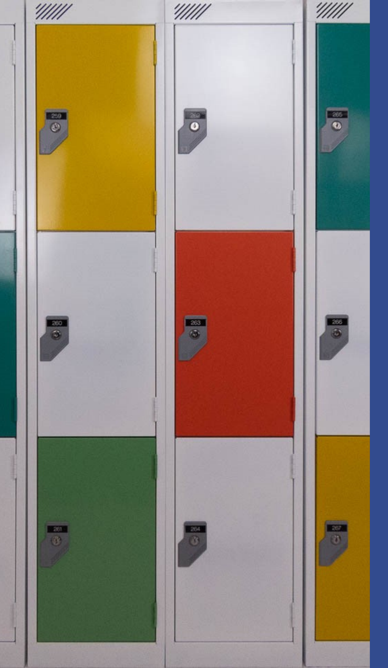
Helmsman - The Complete Package