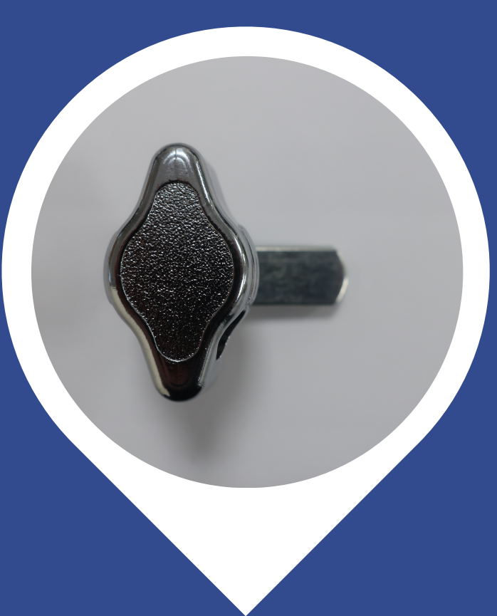
Standard Cam Lock