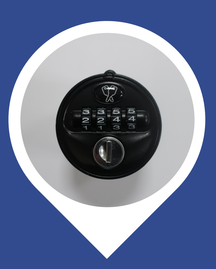
L&F 2800 4 Digit Combination Lock