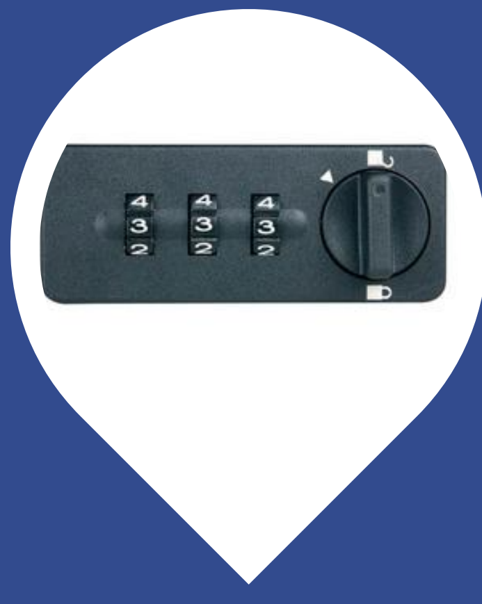
Standard Hasp Lock